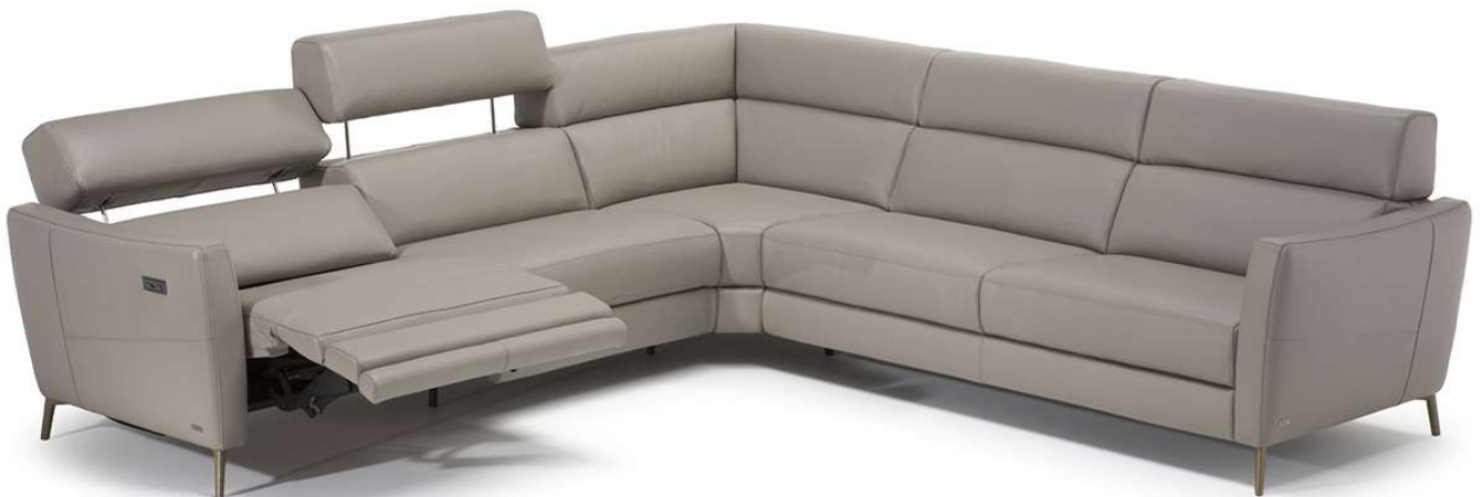
■ Vers. F50+F38+011+019