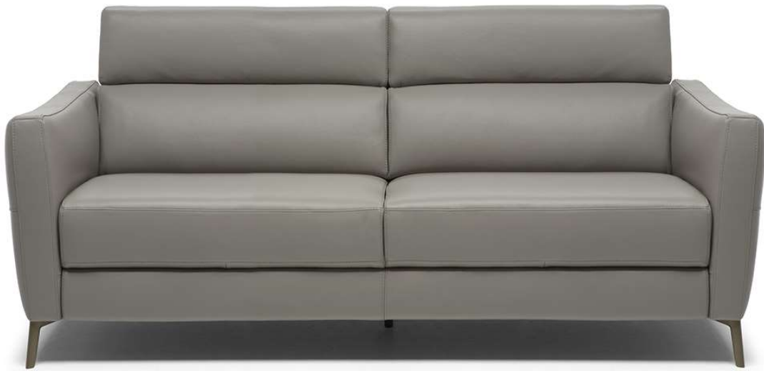
■ Vers. 009